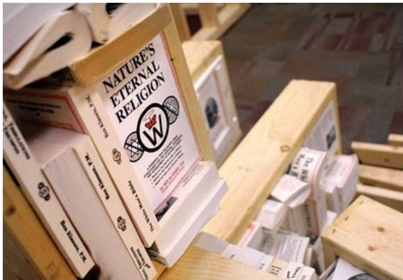
Books Destroyed In The Name Of Art.

The University of Montana's Mansfield Library will play host to a controversial art exhibit beginning January 7, 2010. "Speaking Volumes: Transforming Hate" is an exhibit based on the deliberate destruction of books. A feature article on the exhibit in the January 3 Missoulian Online generated a firestorm of heated comments, pro and con. Roughly 4,000 books were rendered unreadable by over 100 artists to create the art works represented in the library's gallery. All of the books were donated by one man--known only by the initials "J.R."--in exchange for nothing more than a one-way ticket out of Montana.